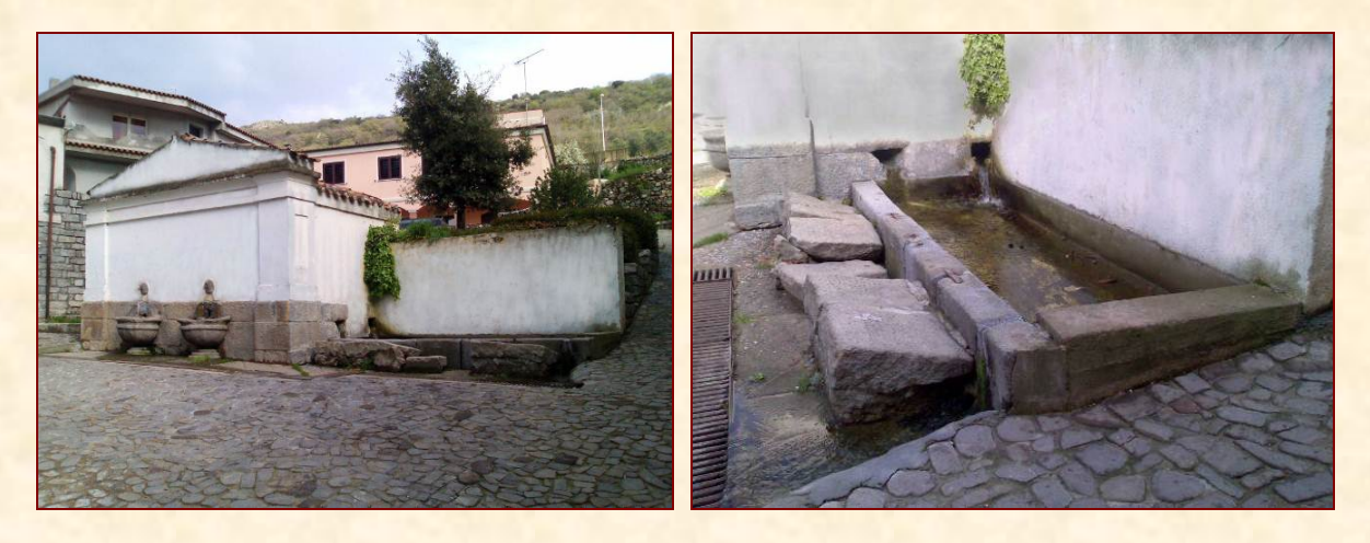
"Hantaru Vezzu" (the old source)