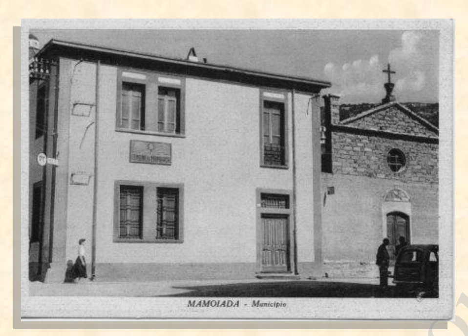
Town hall in a postcard of the early 60s