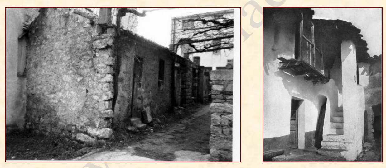
Vintage photos with country views